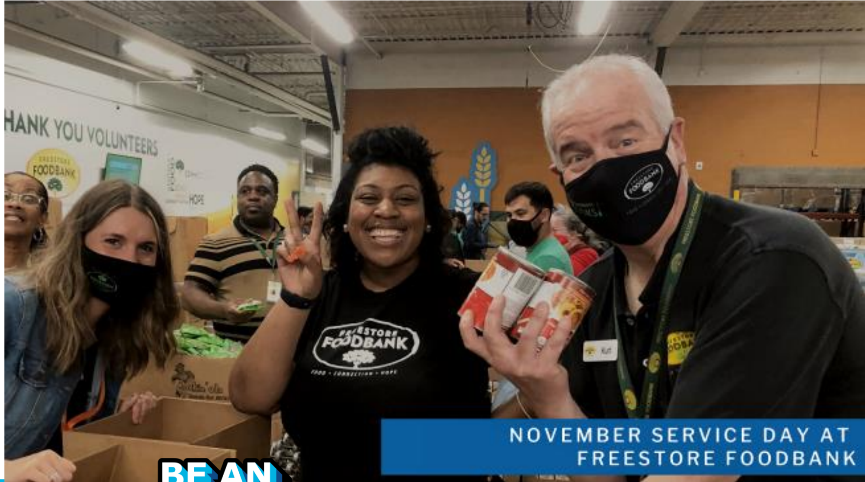
NOVEMBER SERVICE DAY AT FREESTORE FOODBANK

People who stand up for themselves and others. They harness their character strengths to find their moment and pursue justice, both great and small, inspiring others to be the best of humanity today.