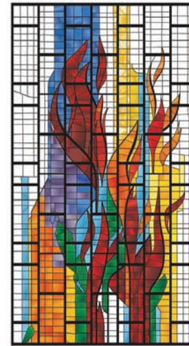
TEMPLE ISRAEL OF THE CITY OF NEW YORK