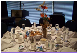
Midwest District Lunch