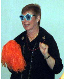
Now she made us laugh