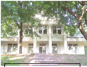
Bayit at OSRUI