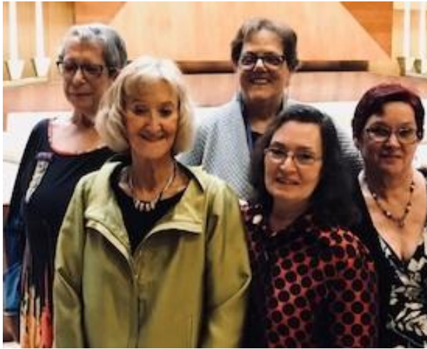
Congregation in Sioux Falls, SD.

May through June was a time for many sisterhoods and women's groups to come together, and we were thrilled that you invited WRJ District leadership to join your celebrations.